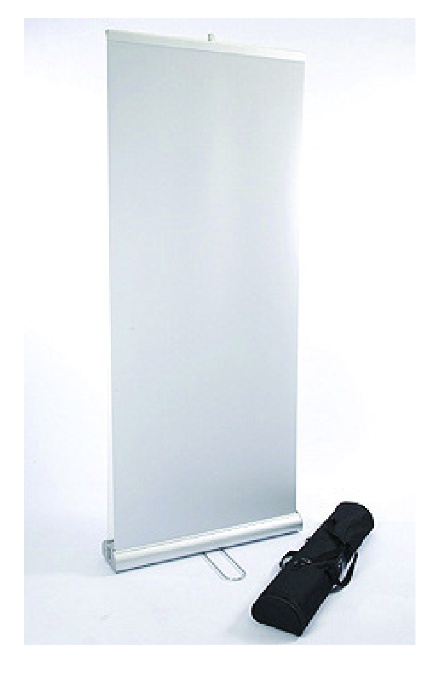
Elite Banner Stand Double Sided