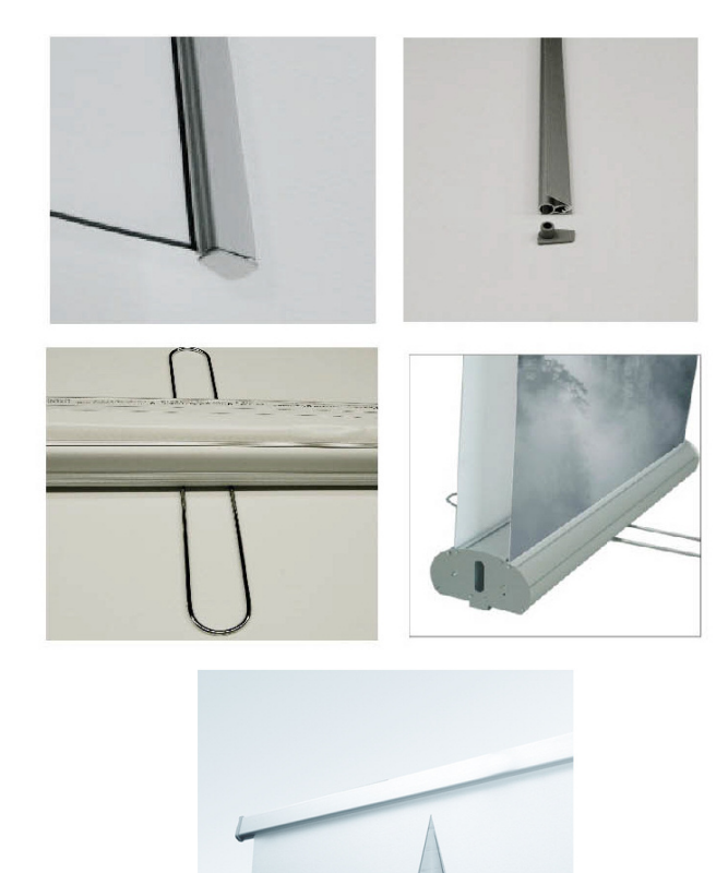
Stylish Top Rail Clamp style for easy change of graphics Holds graphics securely